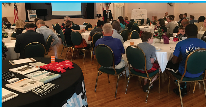
Slavic Village, June 2017