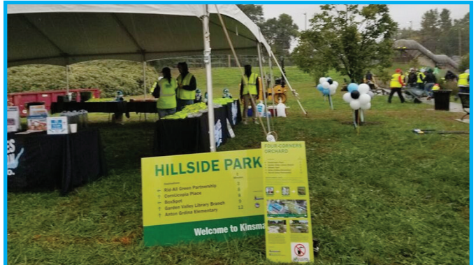
Hillside Park, October 2018