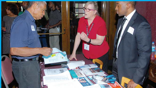
Karamu event, July 2016

Throughout the OC2 Project, Great Lakes was routinely present in the community. Two community outreach events were held near the project site each construction season. These meetings were intended to give the Great Lakes' team and the community a chance to get to know each other and keep the lines of communication open. ■