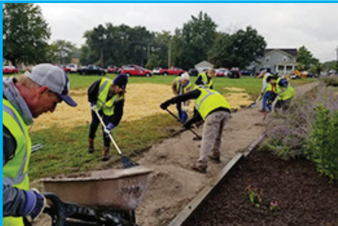
Crew prepares the pathway for bikes and pedestrians