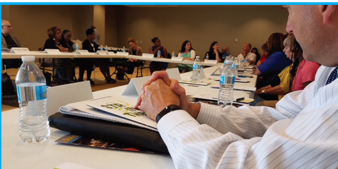
Central, June 2018