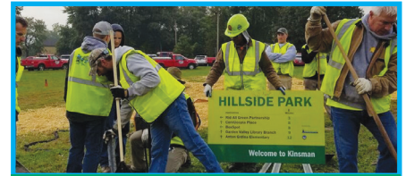
The new Hillside Park sign is ready for display

In partnership with Burten, Bell, Carr Development Corporation, The Great Lakes Construction Co. committed to helping revitalize Hillside park, located on Minnie Street in the Garden Valley neighborhood. Crews faithfully mulched plant beds and trees, removed exposed concrete slabs, performed final grading, cleaned up around pedestrian paths, removed concrete areas and planted perennials. A Hillside Park sign was erected close to the Greater Cleveland Regional Transit Authority Station and East 79th Street. ■