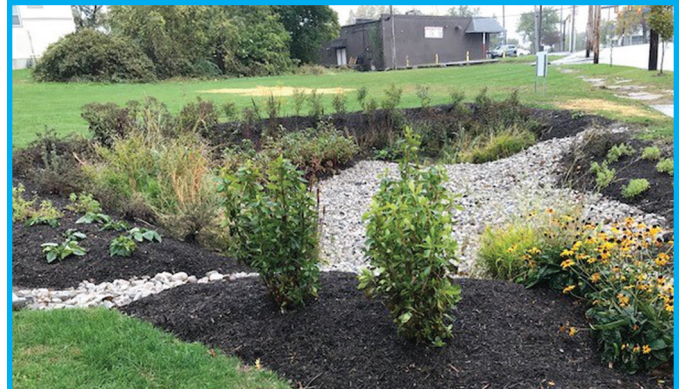
Cleaned and revitalized rain garden